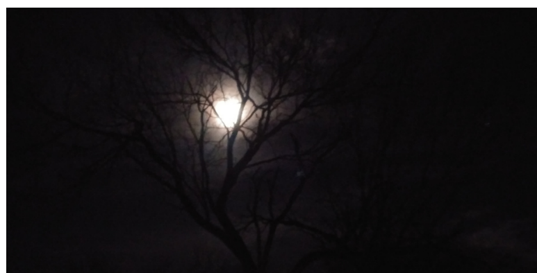
Easton Rankin Junior Long Exposure Best in Class (moon photo)